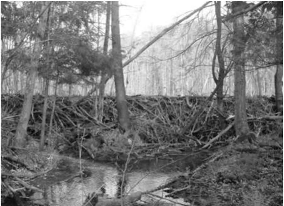
The prettiest beaver dam in Northern New York, located at Seven Springs. It's about as tall as a man.